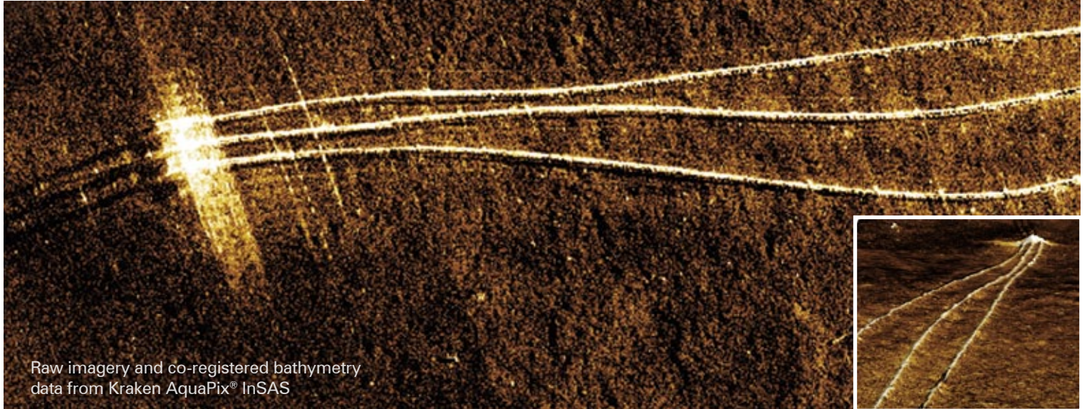
Raw imagery and co-registered bathymetry data from Kraken AquaPix® InSAS